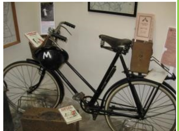
Inspiration: a relative's mum's WWII bike on display Charlbury Museum, Oxfordshire, UK

Recently, I reviewed the data from our FUCV EcoGames program, which had approximately 100 participants. It's interesting to see what behaviours participants were readily embracing (e.g., recycling, composting, cooking at home) and what behaviours were less popular (e.g., living car free, using public transit, installing a heat pump or solar panels, participating in a community garden). Interesting tid-bit: in the pre-Covid EcoGames, only 4% of participants attended conferences by video-link! The conclusion I draw is: if governments make it easy for people to do the right thing, such as curbside recycling, people will participate. However, if our society is rigged against these behaviours, you have to be very committed to pursue them on your own. But, just as citizens did their bit for the war effort in World War II, we need to do our bit now to give ourselves, future generations, and the countless other species we share this beautiful planet with a chance for a livable future.