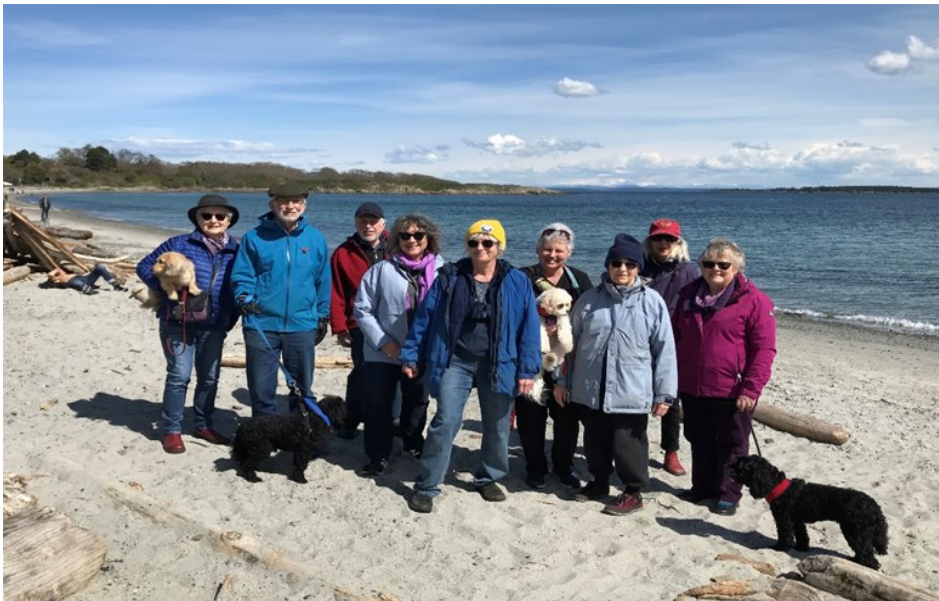
Unitarian Walkers, April 11th, 2022, near Willow's Beach, Oak Bay.